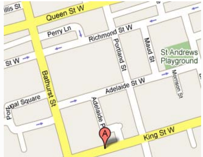
642 King St. W. at Bathurst St.